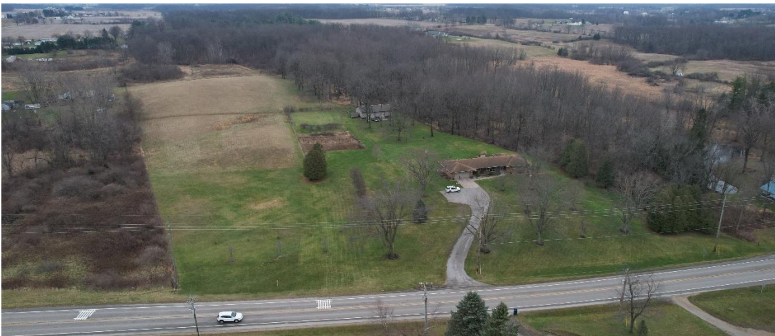
Aerial Images: Top – Looking East Bottom – Looking NE